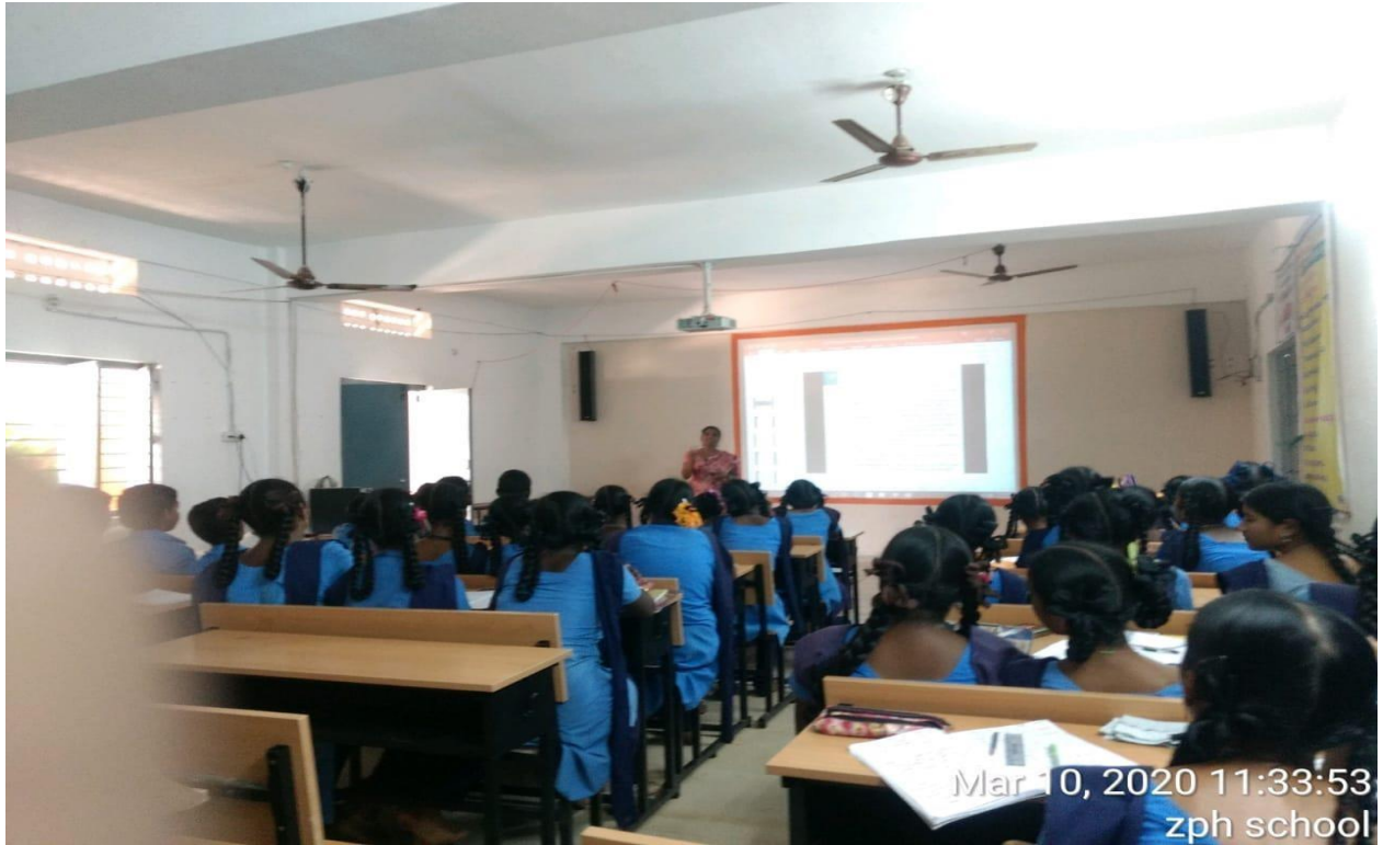
Concepts were explaining using Smart Class