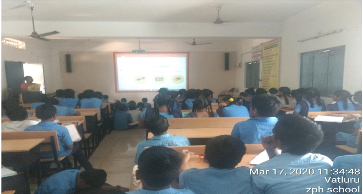
Asking Questions to the students about hardware