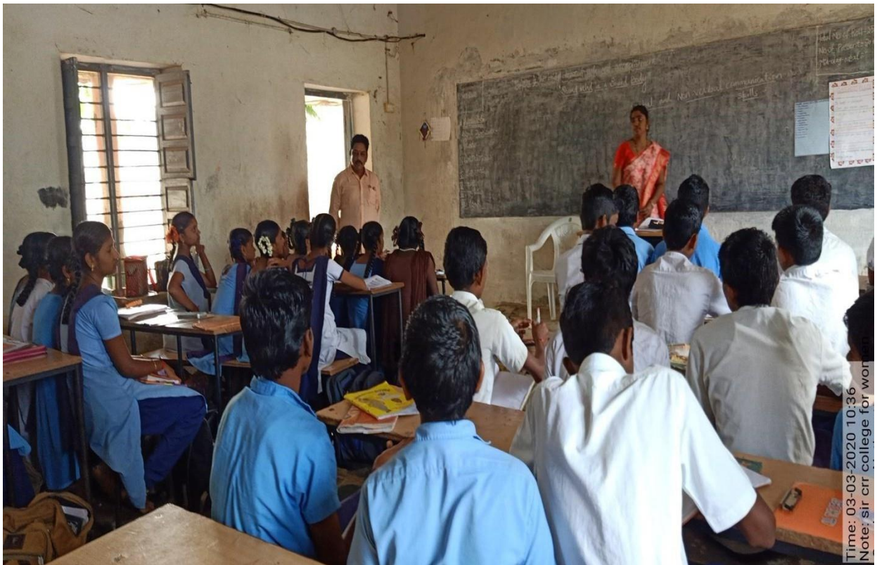
Time: 03-03-2020 10:36 Note: sir crr college for women