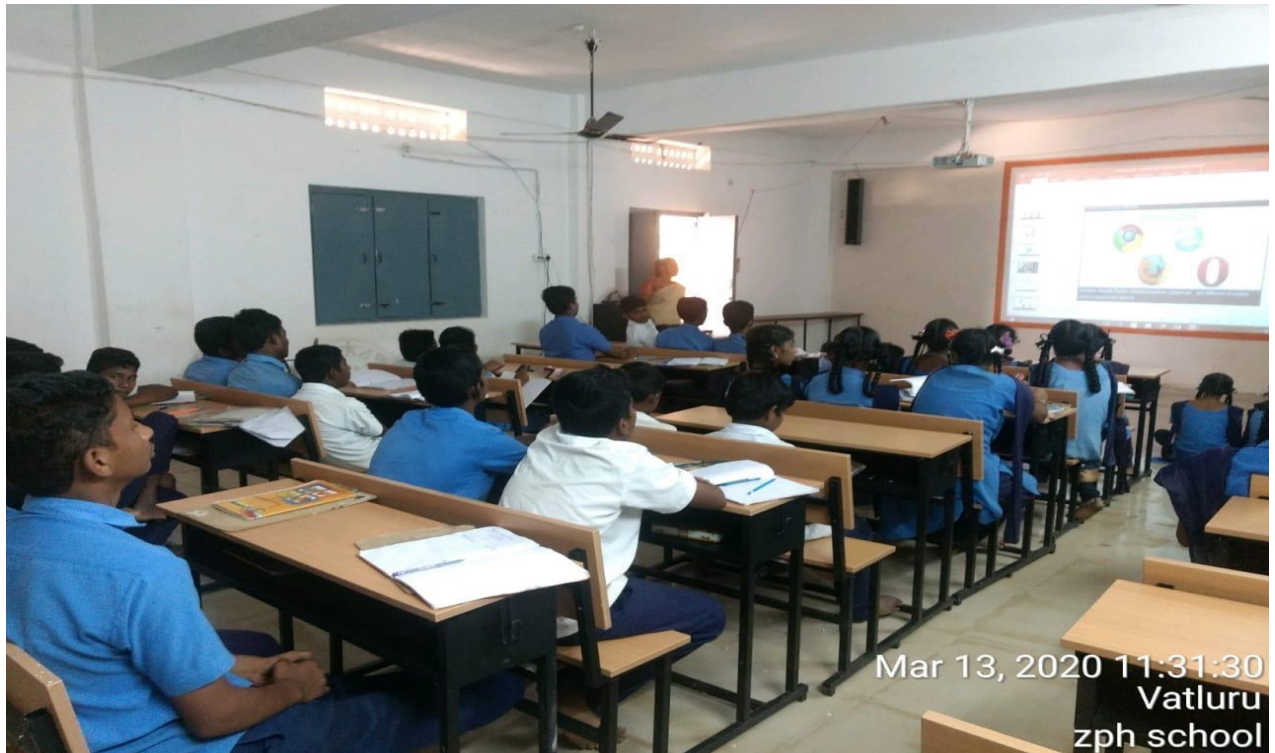
PPT about Internet browsers concepts