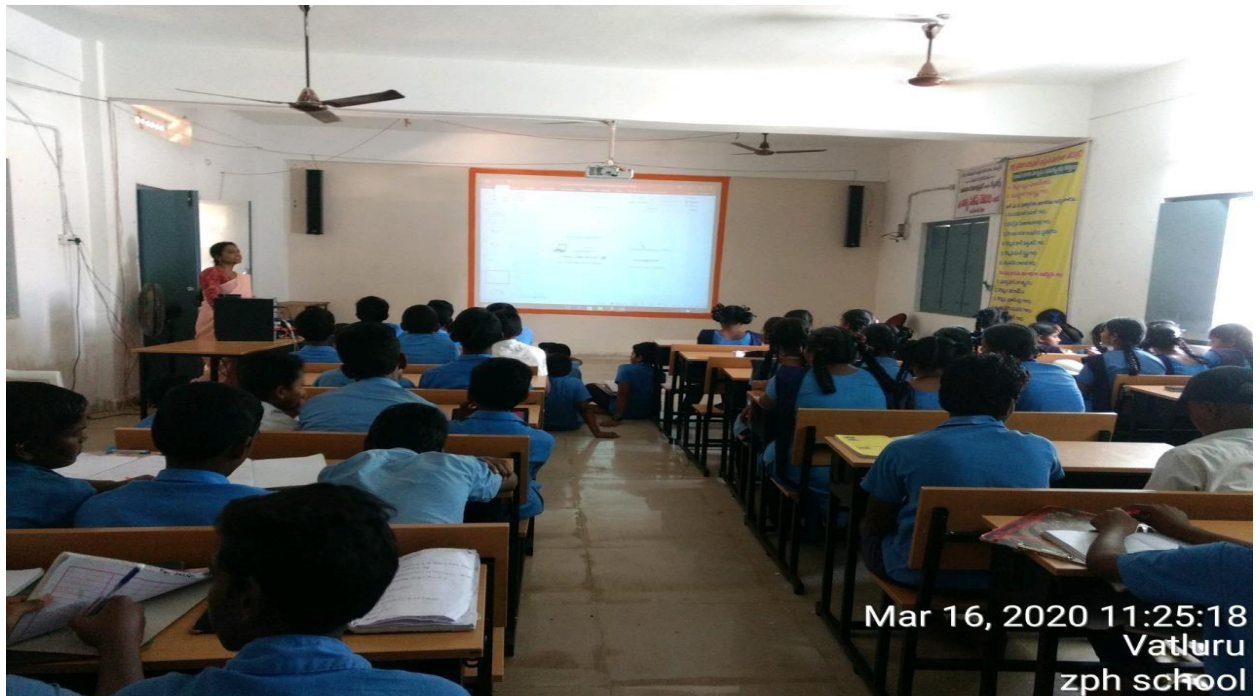
Explaining about system components