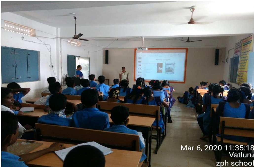
PPT about different types of computers