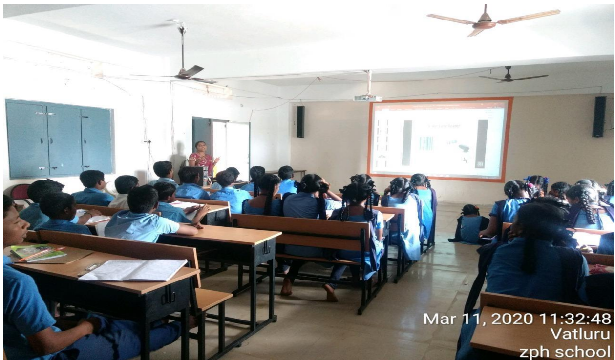
Lecture was given using PPT